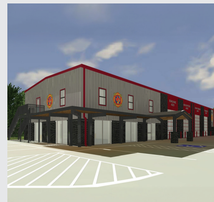
Precinct 4 Fire Station 3 Addition

As a result of the tax sales revenue, plans are underway to expand Station 3, located at Raymond Stotzer Parkway and Lightsey Lane, by adding two additional bays for new apparatus, renovating the front elevation of the fire station and address several existing fire safety code issues. Expected completion of the renovation is February 2025.